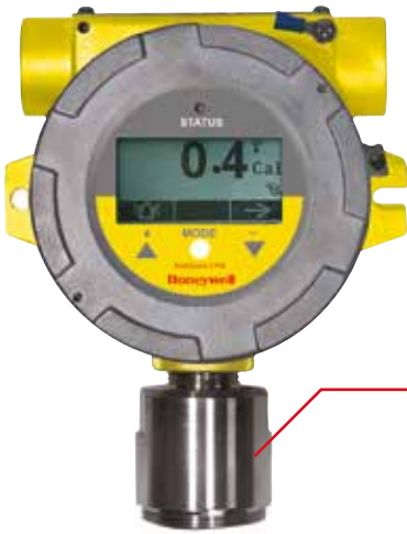
RAEGuard 2 Fixed Sensor Head