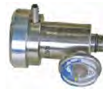
Demand flow regulator