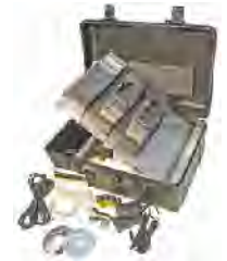
MicroDock II portable system kit