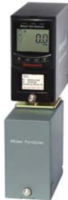
Midas Gas Detector with Midas Pyrolyzer